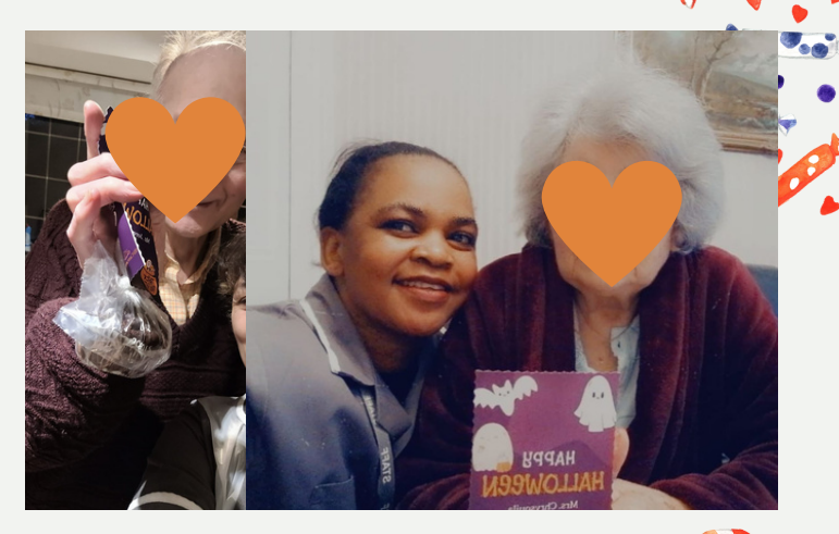
image is testament our commitment to providing not just healthcare, but also companionship and shared joy in the moments that matter. These celebrations are an integral part of our holistic approach to care, where emotional well-being is as valued as physical health.